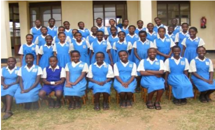
P7 School Leavers