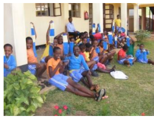
Knitting Coloma Scarfs