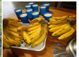
Climbing Frame Pupil leaving on a bodaboda Pineapples Weeding beans Banana Feast